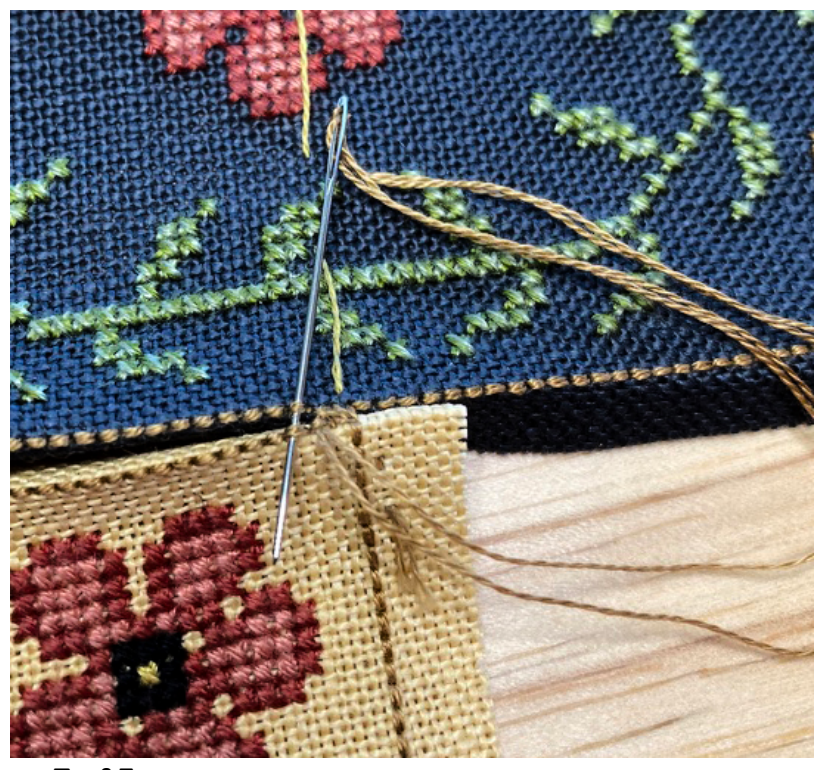
3 of 5