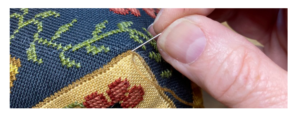
12.Feed your needle under the backstitching to bury your threads. Then clip.

10.Stuff the Biscornu. Be sure to get your stuffing into the corners so the points are pointy. It will take more stuffing than you would think. 11.Once you're done stuffing the Biscornu, finish stitching the backstitches together on the 8th side.