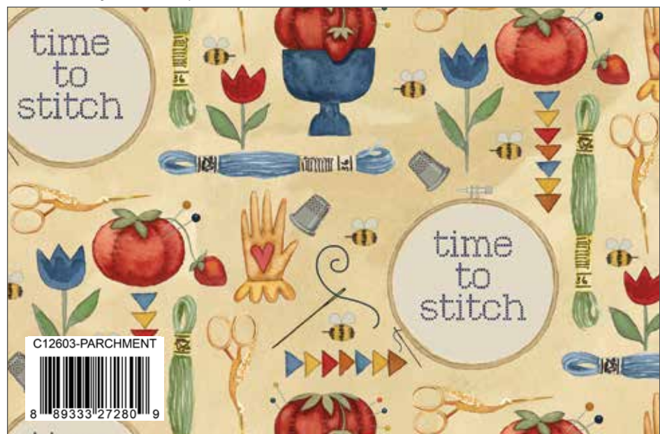
Parchment Stitchy Birds Tools