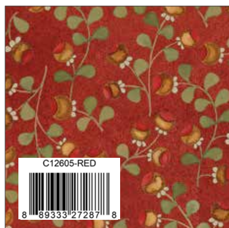
Red Stitchy Birds Vines