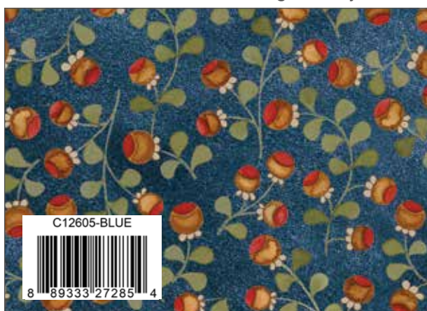
Blue Stitchy Birds Vines