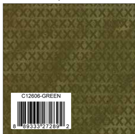
Green Stitchy Birds Stitches