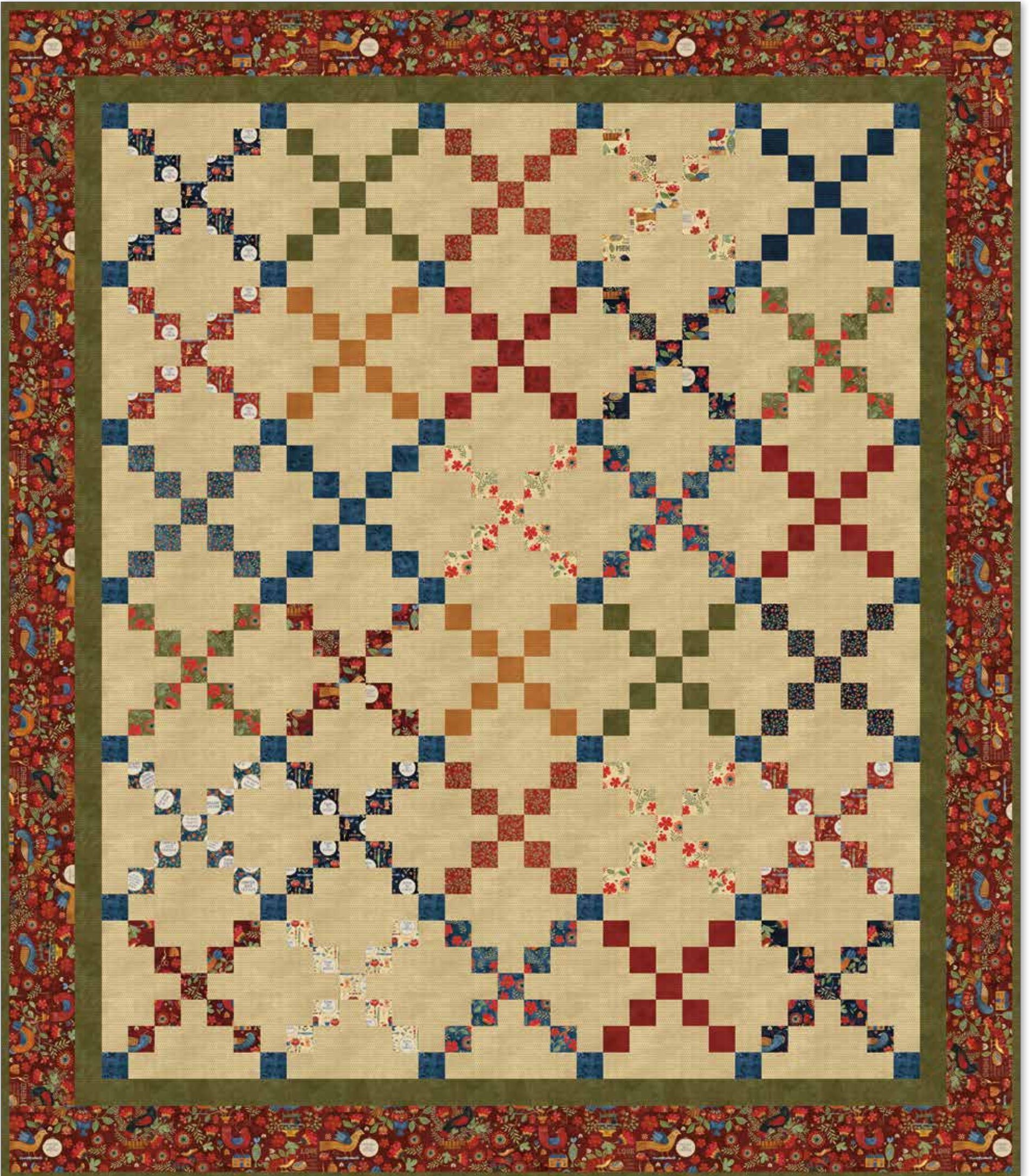
Quilt Size 76" x 88"