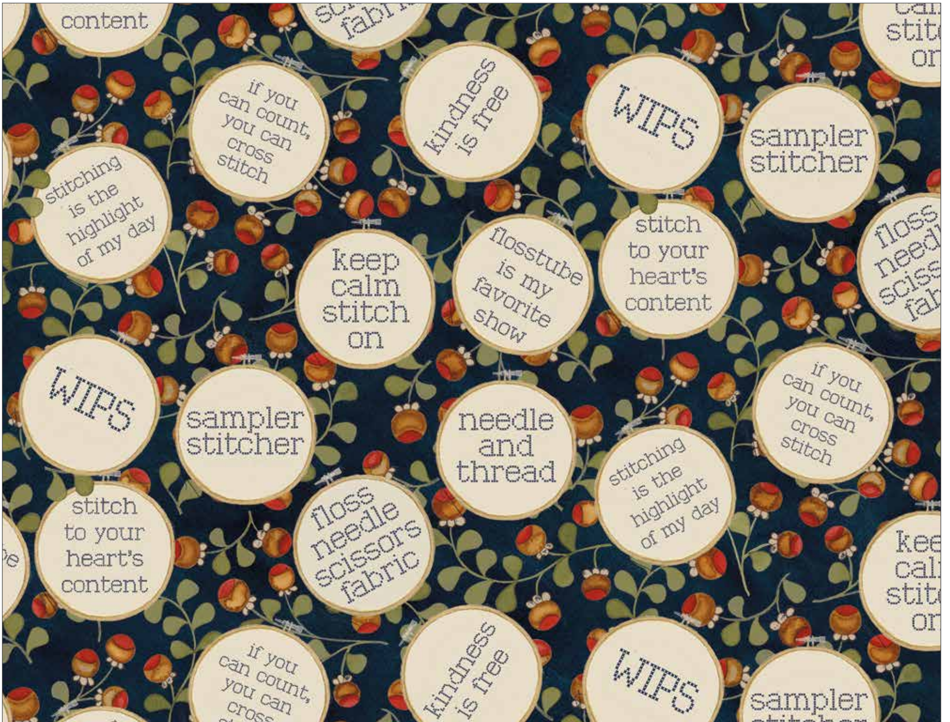
C12602 Midnight Stitchy Birds Hoops