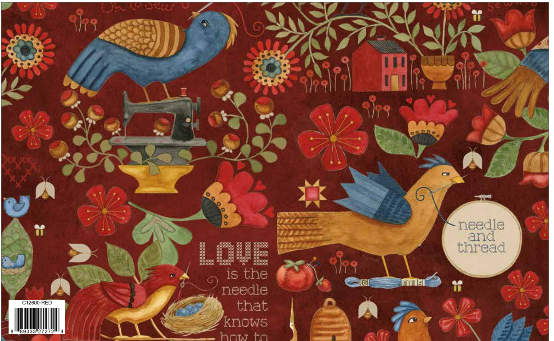
Red Stitchy Birds Main