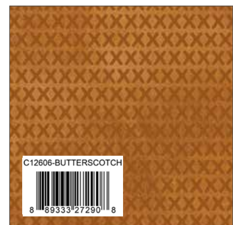
Butterscotch Stitchy Birds Stitches