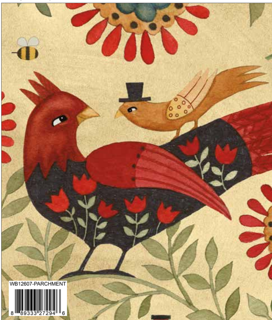
Parchment Stitchy Birds Wide Back