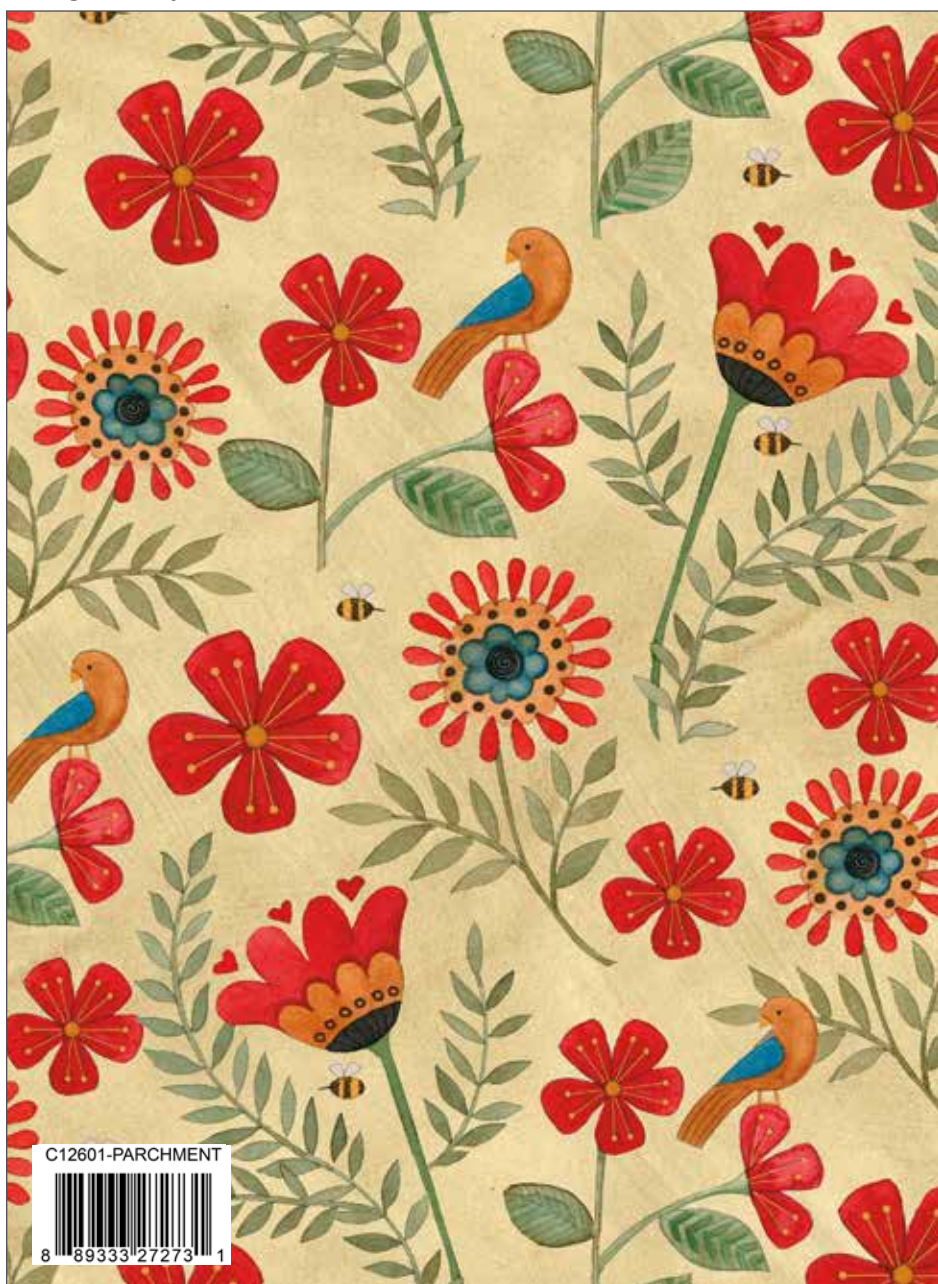
Parchment Stitchy Birds Flowers