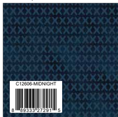
Midnight Stitchy Birds Stitches