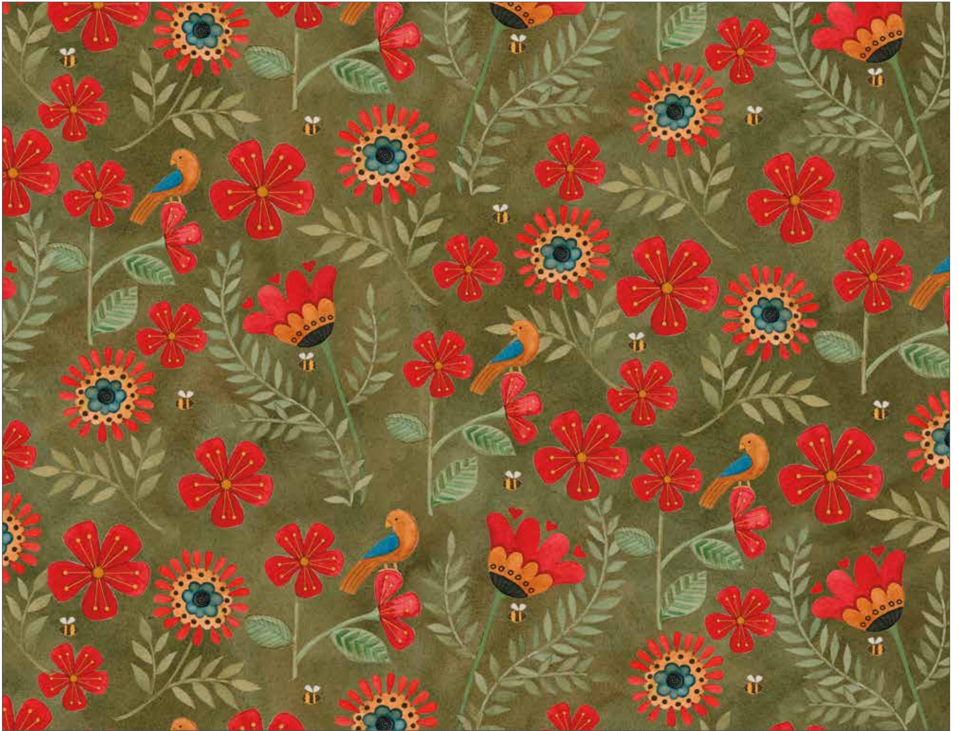
C12601 Green Stitchy Birds Flowers