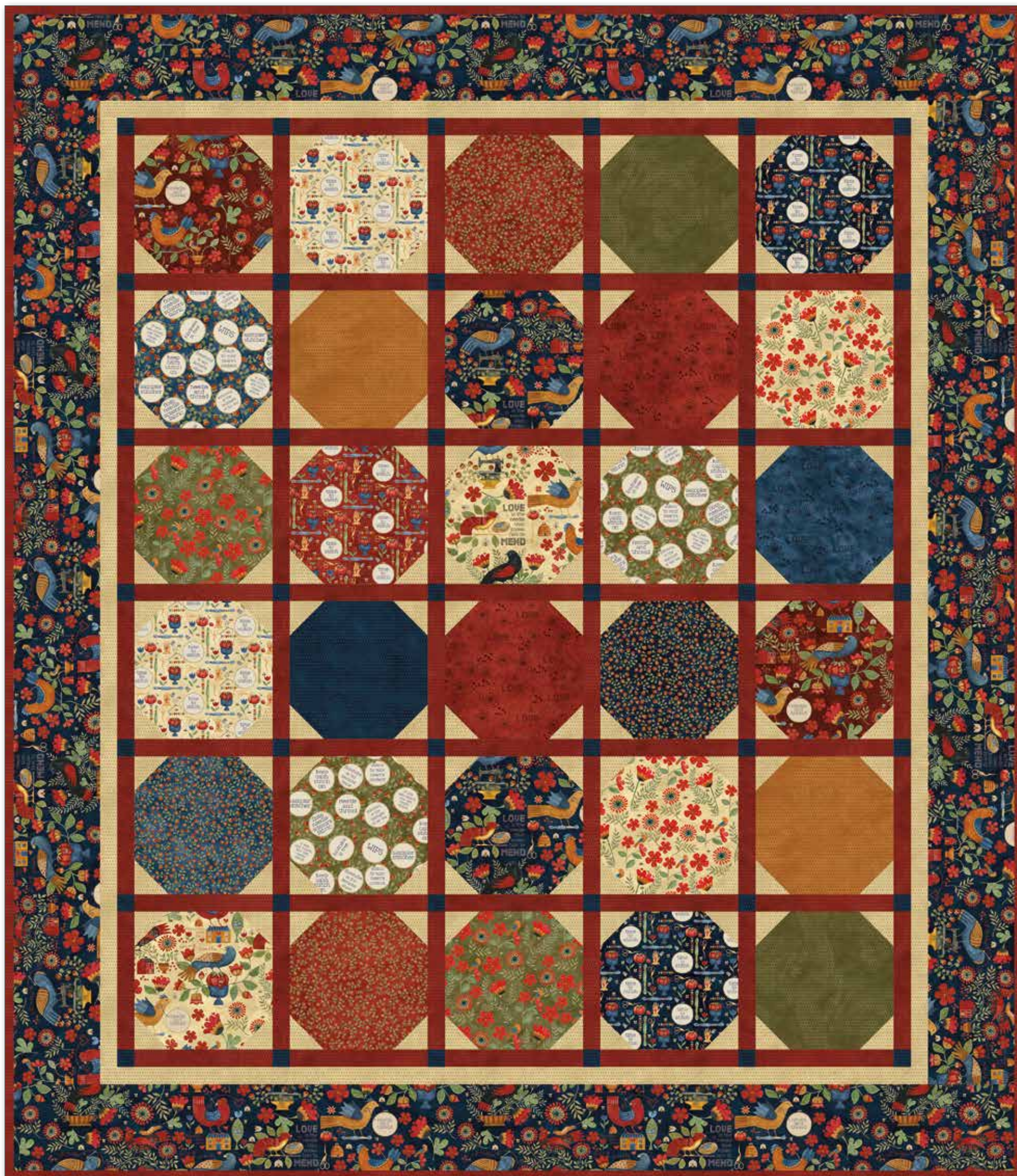
Quilt Size 58" x 67"