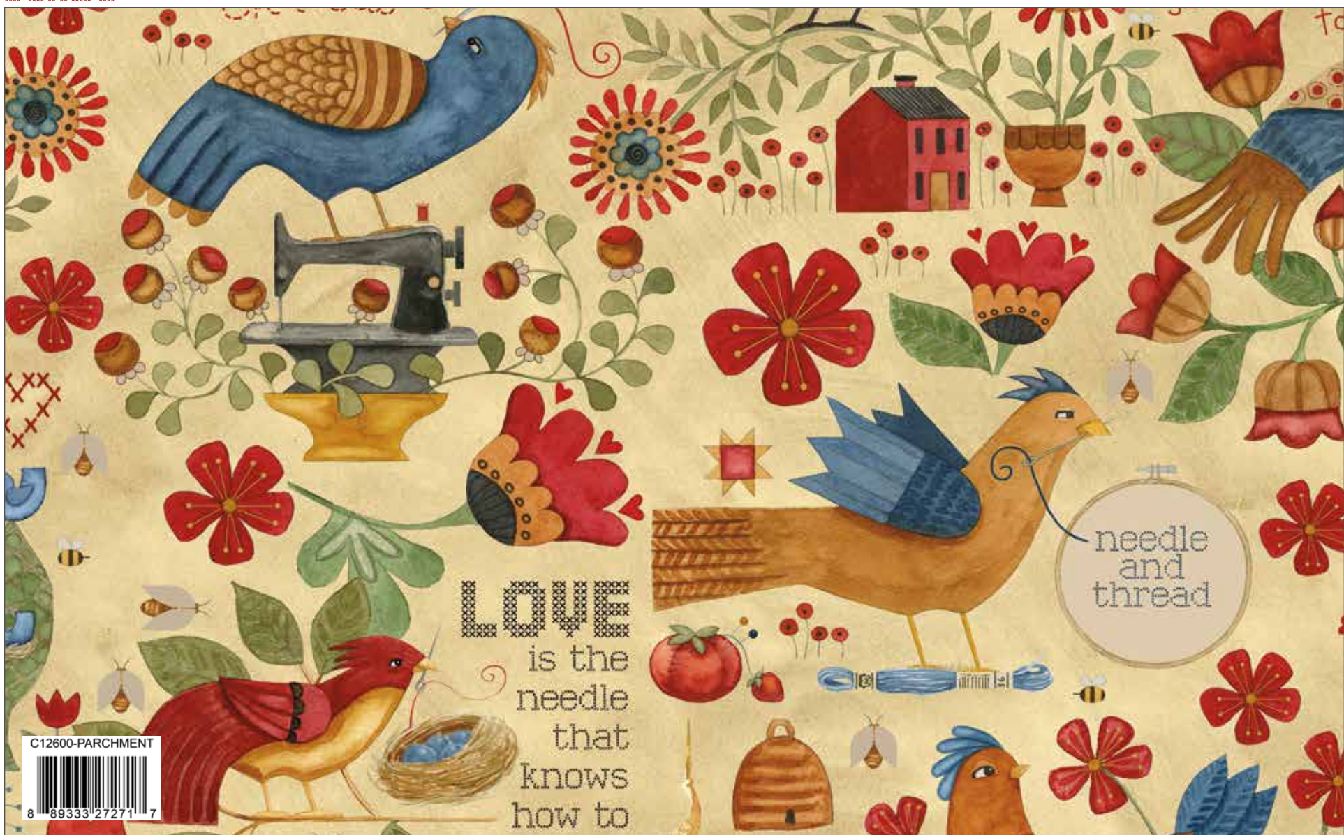
Parchment Stitchy Birds Main