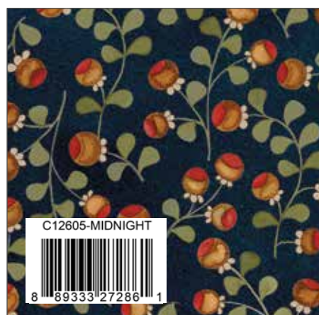
Midnight Stitchy Birds Vines