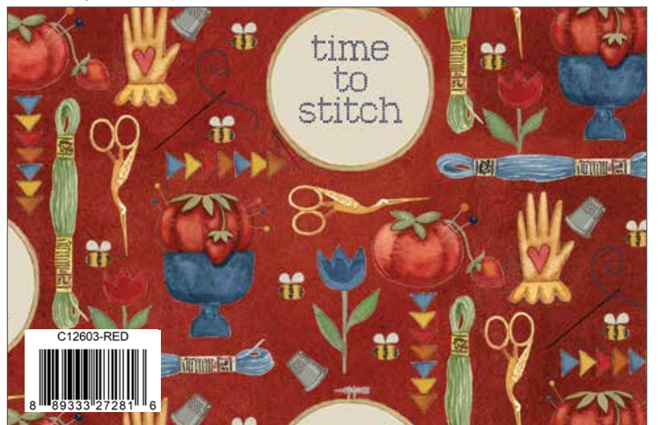
Red Stitchy Birds Tools