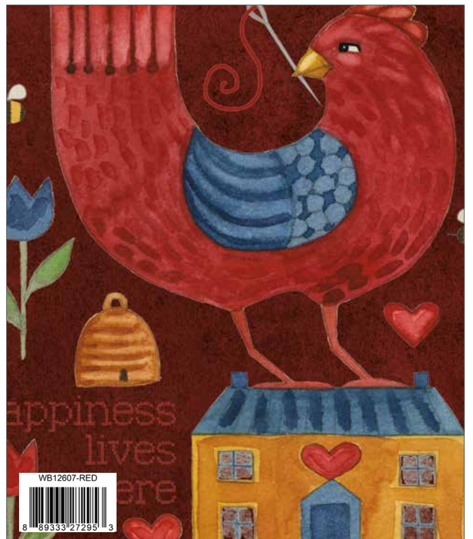
Red Stitchy Birds Wide Back