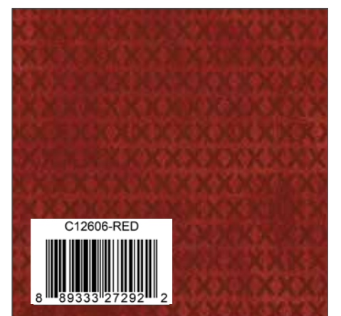
Red Stitchy Birds Stitches