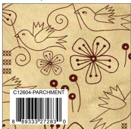
Parchment Stitchy Birds Love