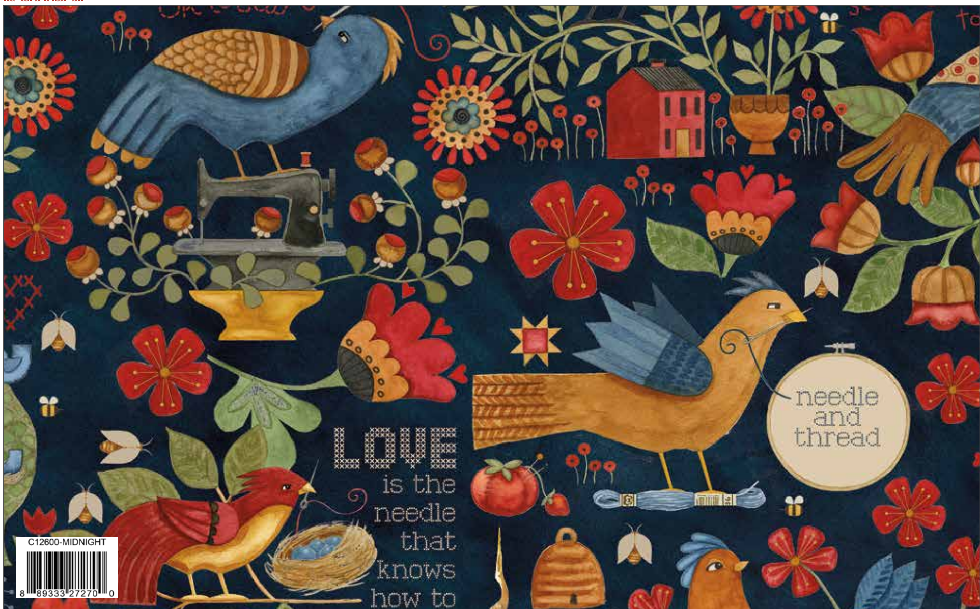
Midnight Stitchy Birds Main