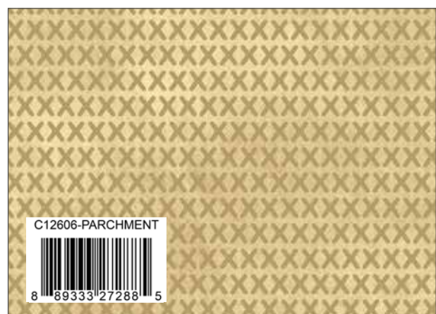
Parchment Stitchy Birds Stitches