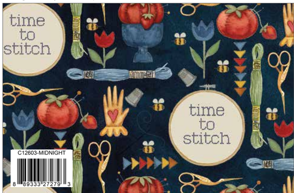
Midnight Stitchy Birds Tools