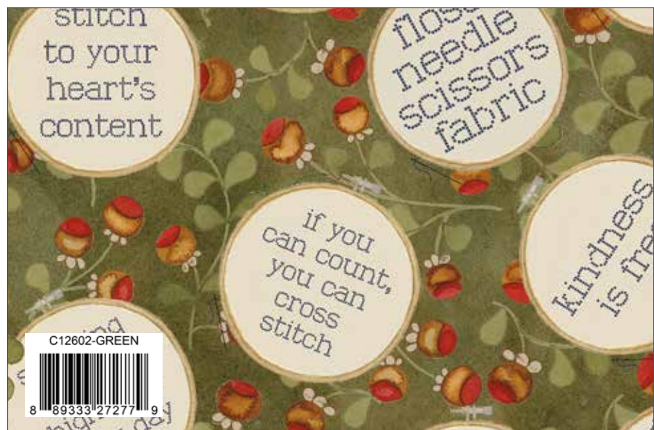
Green Stitchy Birds Hoops