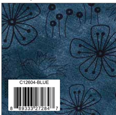
Blue Stitchy Birds Love