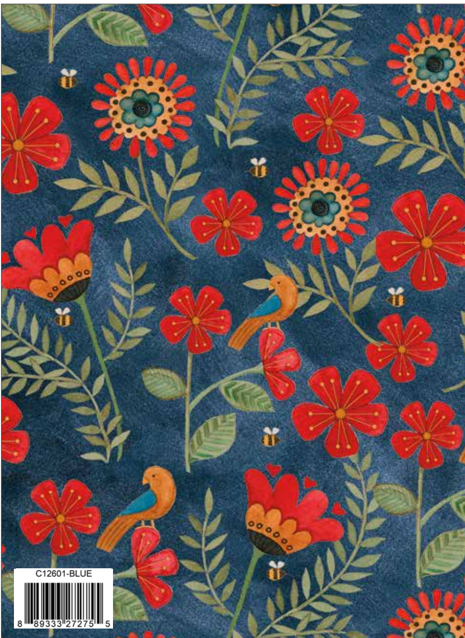
Blue Stitchy Birds Flowers