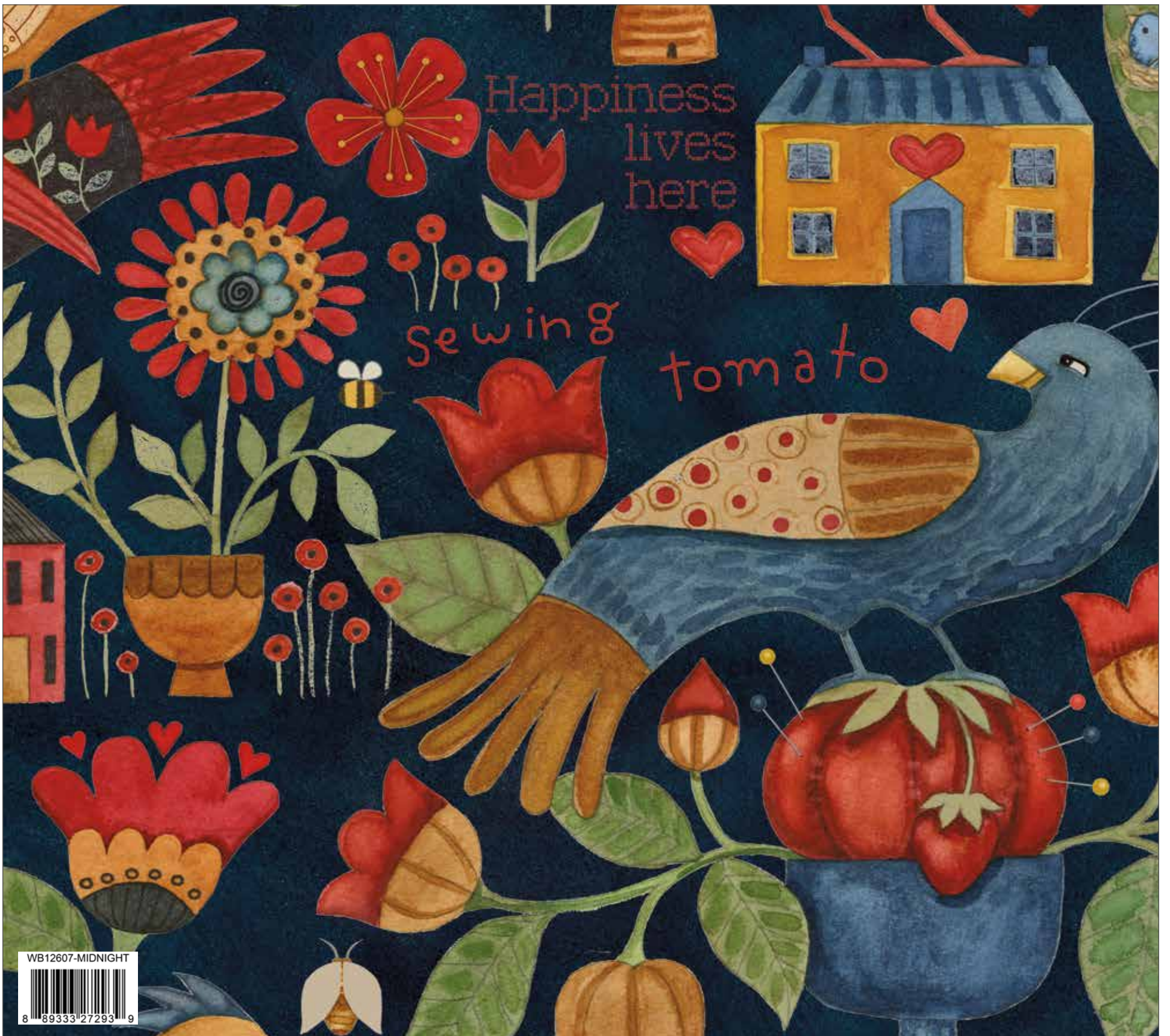
Midnight Stitchy Birds Wide Back