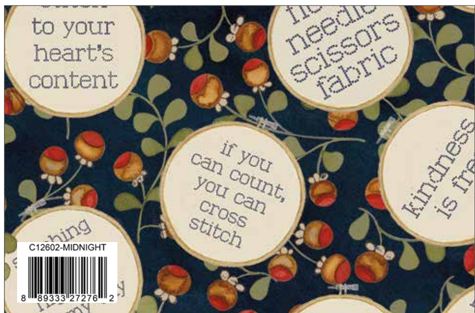
Midnight Stitchy Birds Hoops