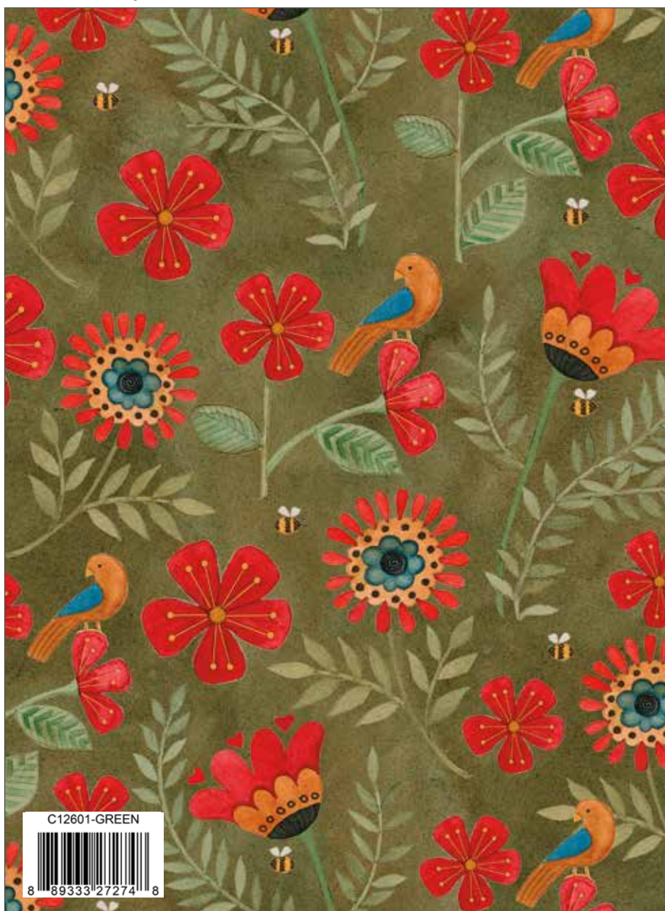
Green Stitchy Birds Flowers